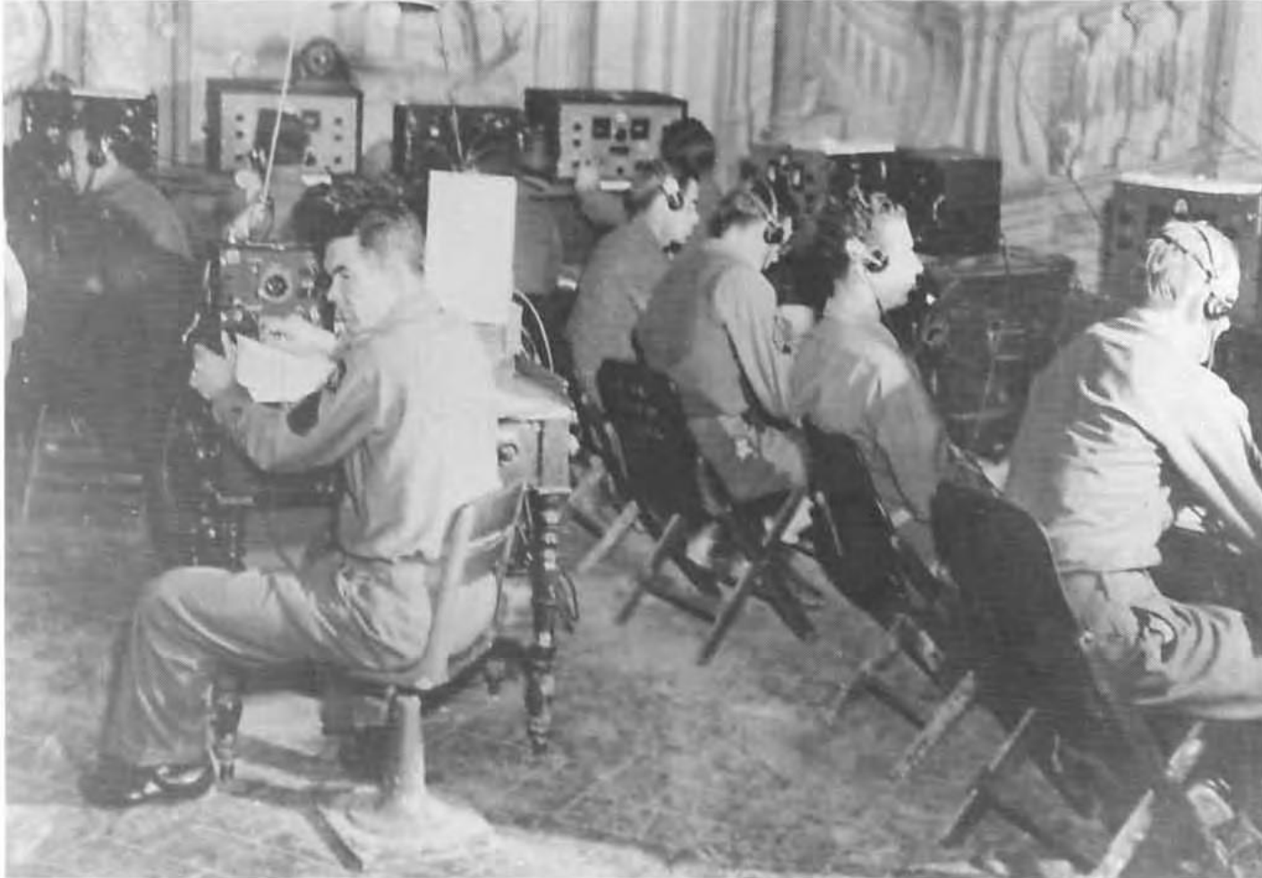
Intercept personnel of the 128th Signal Radio Intelligence Company work out of a commandeered villa in the Mediterranean Theater of Operations.