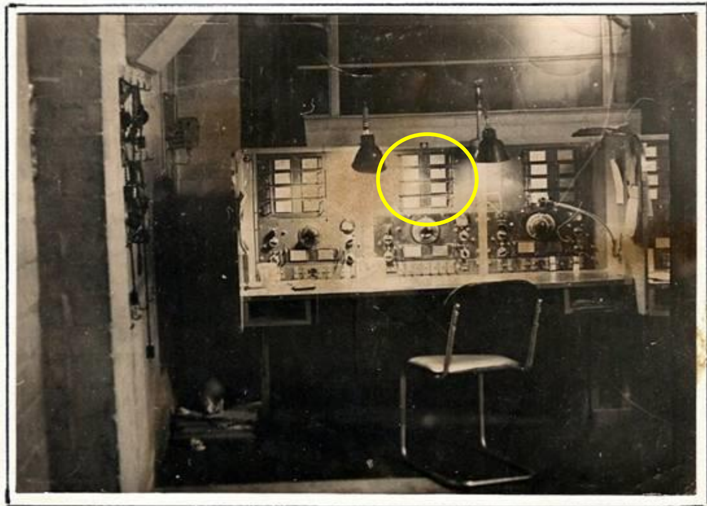
General Search. Bank I6. S.C.U, Hanslope Park.