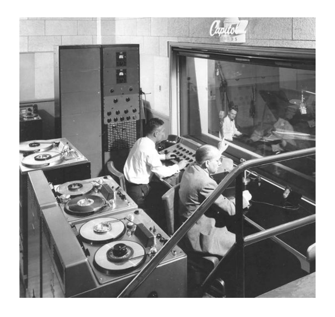
Fig. 6. Models 201 and 300 in use at Capitol Records.