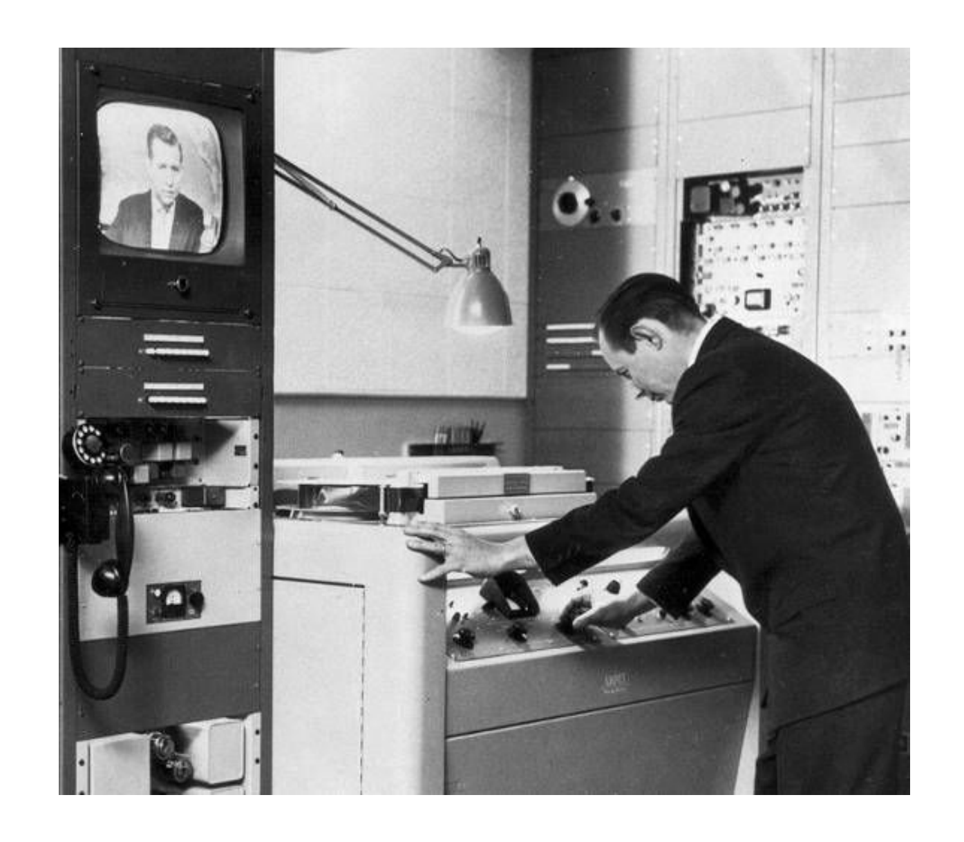
Fig. 11. CBS news anchor Douglas Edwards.