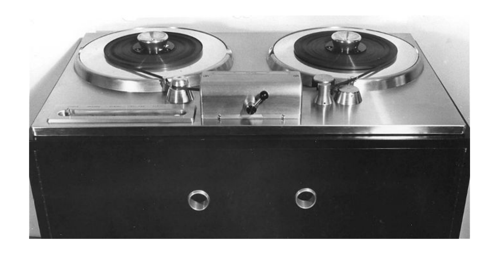
Fig. 4. Model 200A.