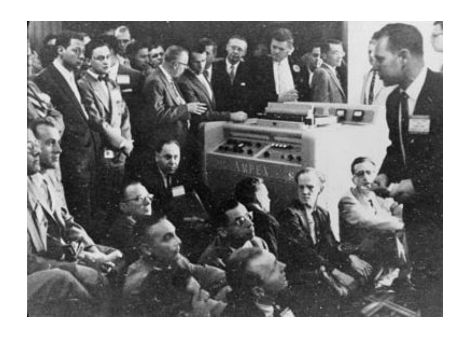
Fig. 10. Videotape recorder introduction, 1956, April 14.