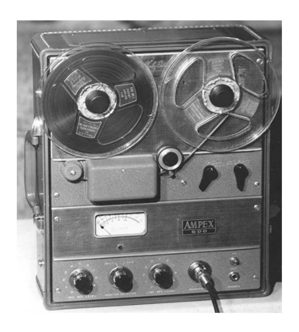
Fig. 8. Model 600