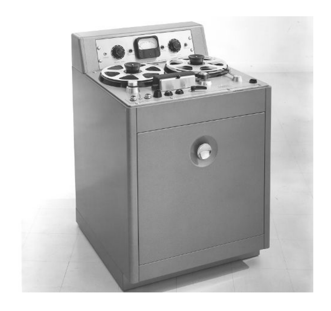
Fig. 5. Model 300.